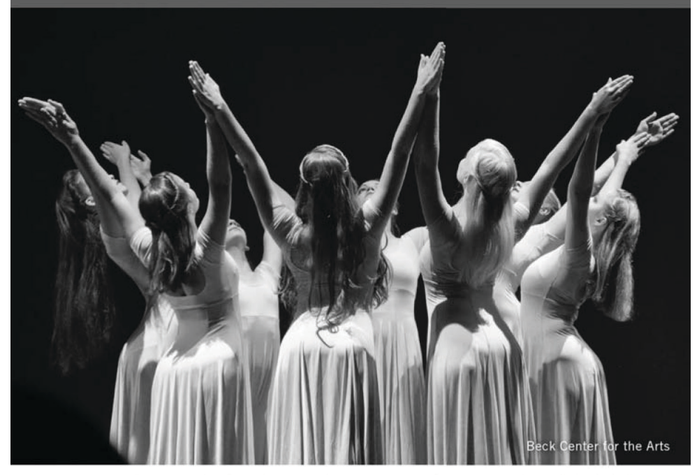
... WITH INVESTMENT BY CUYAHOGA ARTS & CULTURE

Cuyahoga Arts & Culture (CAC) uses public dollars approved by you to bring arts and culture to every corner of our County. From grade schools to senior centers to large public events and investments to small neighborhood art projects and educational outreach, we are leveraging your investment for everyone to experience.