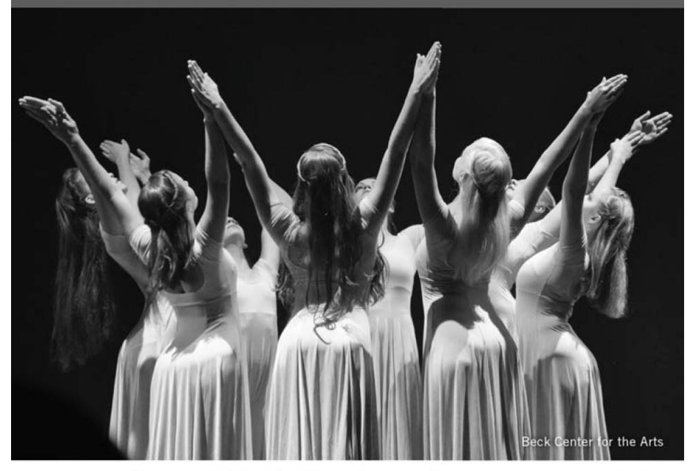
... WITH INVESTMENT BY CUYAHOGA ARTS & CULTURE

Cuyahoga Arts & Culture (CAC) uses public dollars approved by you to bring arts and culture to every corner of our County. From grade schools to senior centers to large public events and investments to small neighborhood art projects and educational outreach, we are leveraging your investment for everyone to experience.